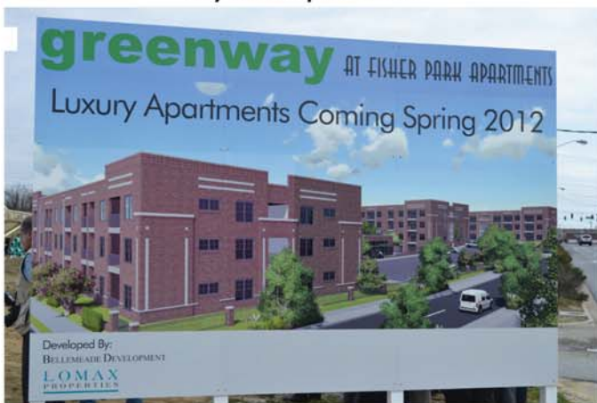
Greenway at Fisher Park Apartments