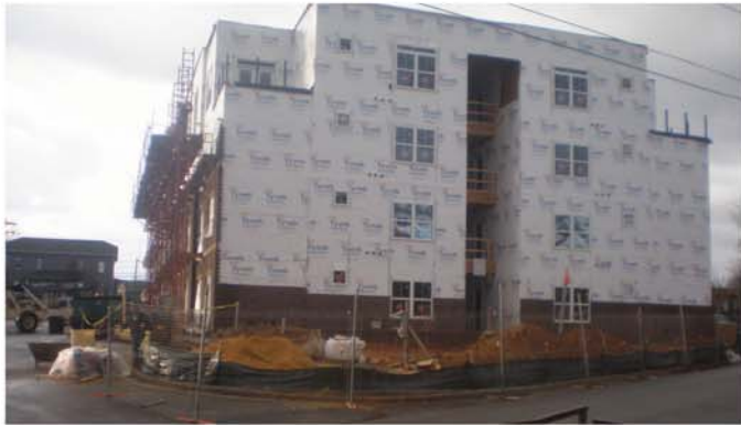
City View Apartments

Visit downtownfridays.com monthly for map and event details