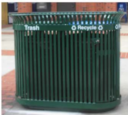
Downtown Recycling Containers

As the community looks for new practices to improve sustainability, Downtown continues in a leadership role by recycling and reusing buildings, maximizing the use of existing infrastructure such as roads, water lines and sewer lines and creating and maintaining parks and trees. A new project has recently launched for Downtown to do even more.